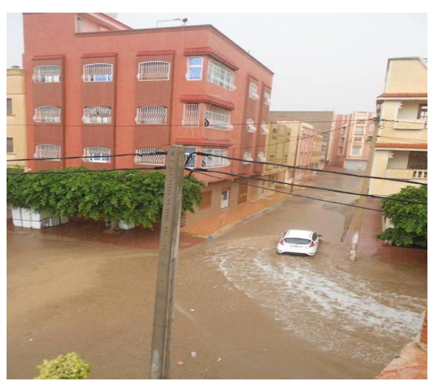
Fig 2:Flooded area in Berkane city ,09/09/2013

The flood area in Berkane city is concentrated in Bouhdila district which is located beside the oued of Cheraa, without the suffisant insfrastructure to deal with the rise in the water level after consisting precipitation.