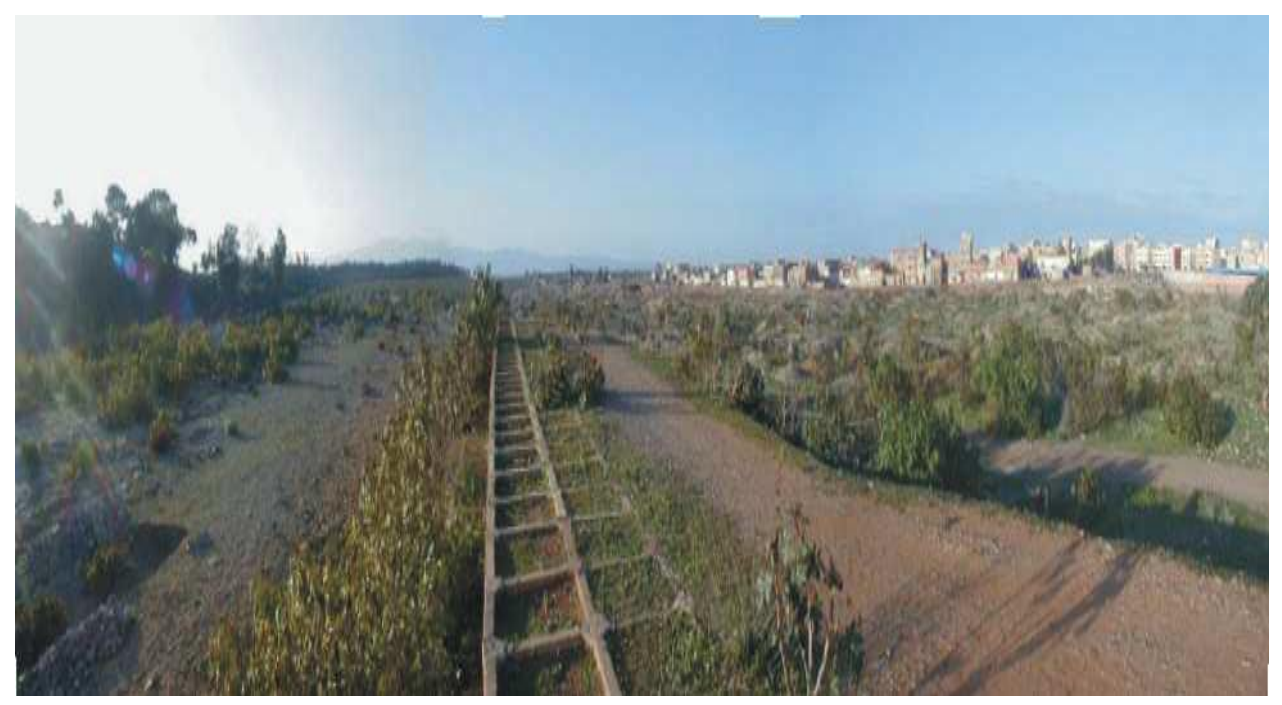
Fig3: Panoramic view of Oued Cheraa and Bouhdila district

The flood area in Berkane city is concentrated in Bouhdila district which is located beside the oued of Cheraa, without the suffisant insfrastructure to deal with the rise in the water level after consisting precipitation.